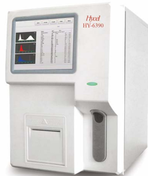
HY-6390 Auto Hematology Analyzer