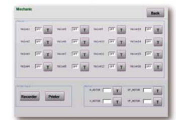
Intelligent hardware diagnosis

HY-6390 is one of HyCel latest model of hematology analyzer combined with reliable hardware and humanized software, for sure it is designed to be as a easy operation diagnostic system with convenience, efficiency, excellent performance. We understand the challenges of the lab including limited budget for reliable product, lack of experienced technician for operating the instrument, that is why HY-6390 coming to the market to minimize your workload. We are sure that this HY-6390 is a lab assistant worth your experience, we can't wait to see that you will work in a more efficient way with our HY-6390 now.