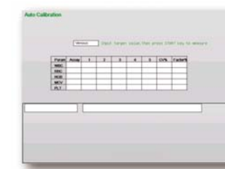
Auto calibration program