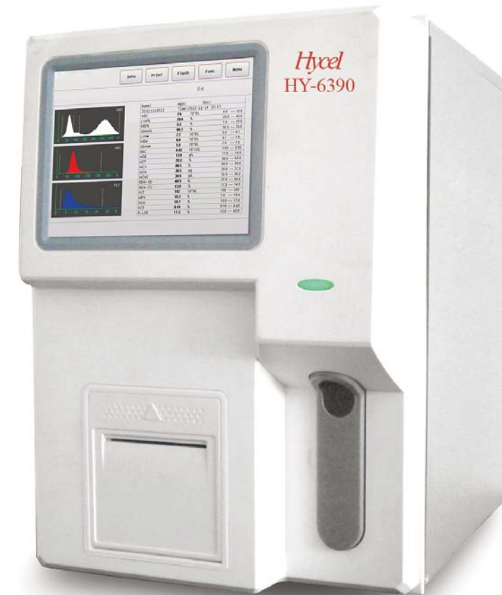
HY-6390 Auto Hematology Analyzer

All is subject to the real object if there is some difference with the model, specification or price.